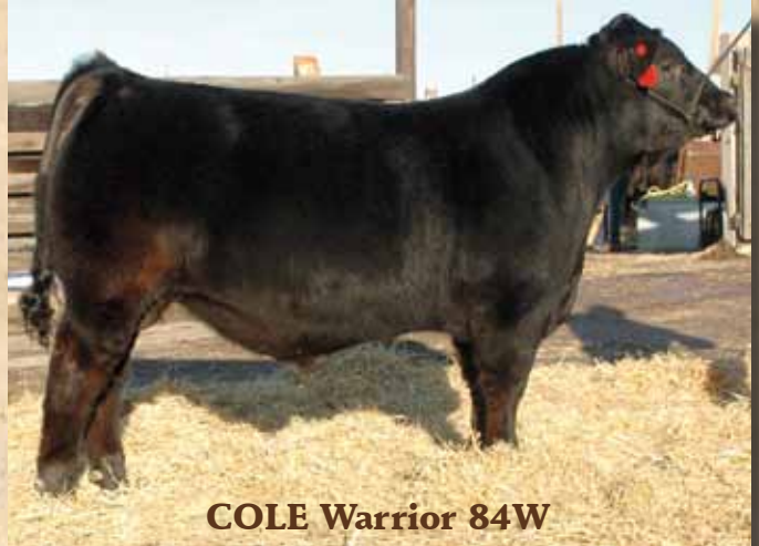
COLE Warrior 84W

03/03/09 BW: 88 Adj WW: 840 Coleman Production 608 x COLE Miss First Down 6166S CED: 5 BW: 2.0 WW: 70 YW: 122 MA: 32 RE: 0.10 MS: 0.40 $MTI: 62