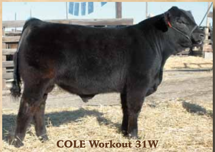
COLE Workout 31W

A homozygous black bull out of our popular 050K donor cow.