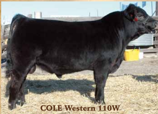
COLE Western 110W

The lead bull in our People's Choice Champion Carload.