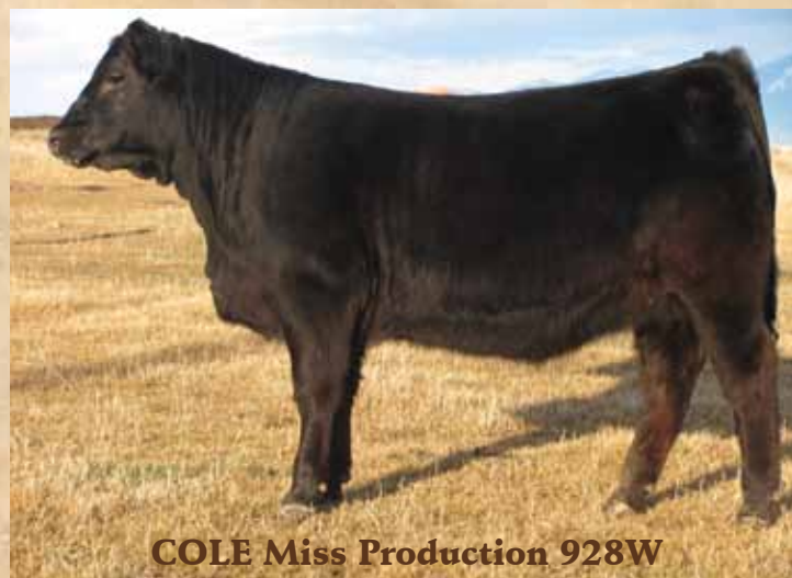
COLE Miss Production 928W

Check our website for more heifer pictures.