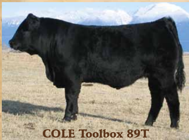
COLE Toolbox 89T

Sire: Carrousel Pure Power Dam: COLE 319N (Wulf Hunt) Born: 03-03-07