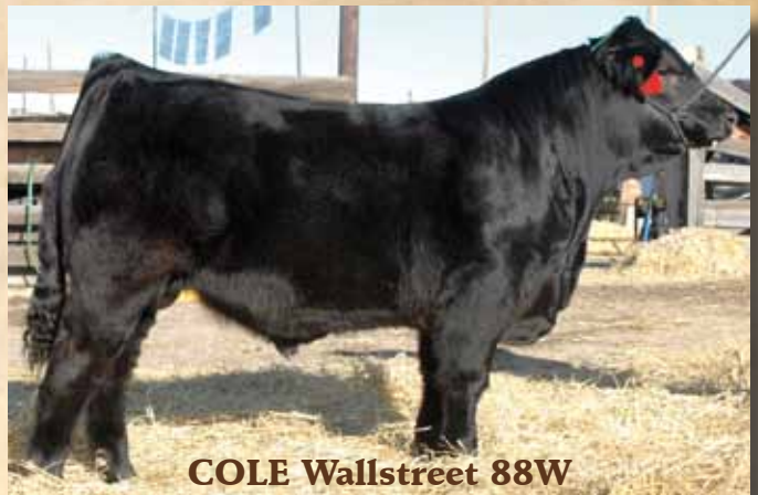
COLE Wallstreet 88W

03/04/09 BW: 86 Adj WW: 776 Carrousel's Pure Power x COLE 319N(Wulf Hunt) CED: 7 BW: 2.5 WW: 52 YW: 93 MA: 13 SC: 0.6 RE: 0.78 MS: -0.03 $MTI: 46