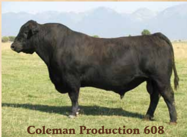
Coleman Production 608