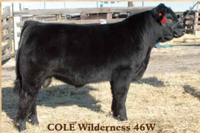
COLE Wilderness 46W

02/24/09 BW: 82 Adj WW: 721 Carrousel's Pure Power x COLE 234M(First Down) CED: 9 BW: 0.4 WW: 40 YW: 77 MA: 16 SC: 0.9 RE: 0.41 MS: -0.05 $MTI: 40