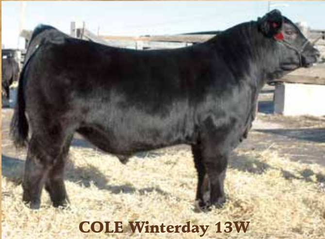
COLE Winterday 13W

Homozygous black and the lead bull in our Reserve Champion Lim-Flex Pen. Ranks in the top 1% for weaning, yearling and $MTI.