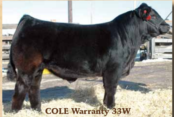
COLE Warranty 33W

A powerful homozygous black Rebound son.