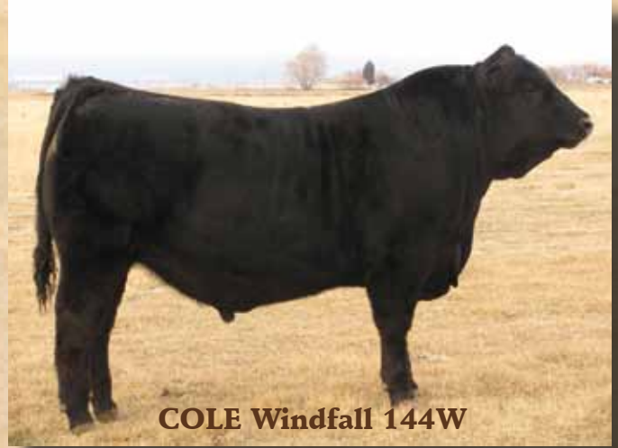
COLE Windfall 144W

Homozygous black and polled. A member of our Reserve Champion Lim-Flex Pen.