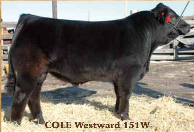
COLE Westward 151W

03/14/09 BW: 86 Adj WW: 772 EXLR Rebound 704R x COLE 893H(First Down) CED: 7 BW: 2.1 WW: 54 YW: 92 MA: 26 SC: 0.8 RE: 0.59 MS: 0.02 $MTI: 47