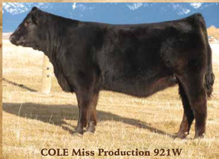
COLE Miss Production 921W