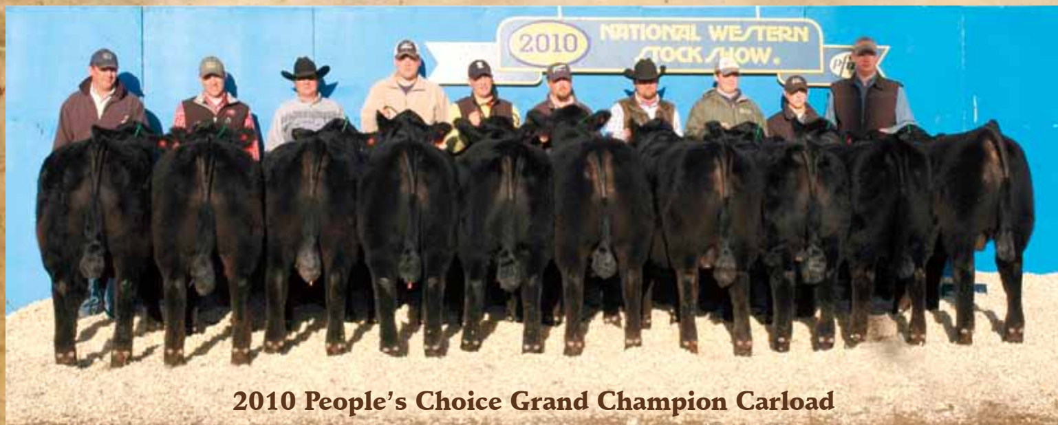
2010 People's Choice Grand Champion Carload