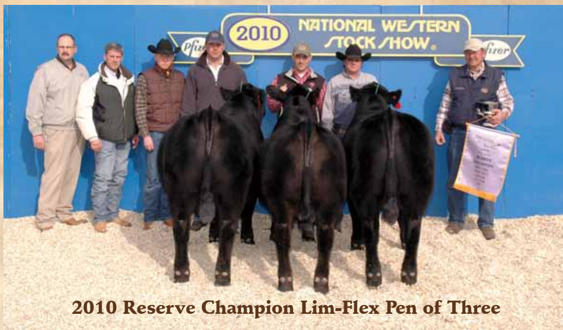
2010 Reserve Champion Lim-Flex Pen of Three

This is the 9th time in the last 13 years that we have been awarded The People's Choice Grand Champion Carload. These sons of COLE Sudden Impact 50S, COLE Toolbox 89T, COLE First Down 46D, EXLR Rebound 704R, HC Final Time 407, and Carrousel's Pure Power are moderate framed and have excellent growth and carcass traits.